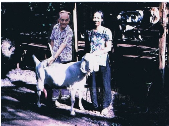
Admiring a Bach Thao x Sannen crossbred doe used for home milk consumption outside of Ho Chi Minh City in South Vietnam.

“In subsequent years, work with the Canadian International Development Research Centre (IDRC) and the International Livestock Research Institute (ILRI) over some 25 years enabled the pursuit of many of these issues across Asia and elsewhere with small ruminants. Some 80 projects and 6 networks were formulated.”