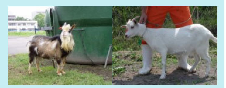
Japanese indigenous goats

The Japan Goat Network is holding its 20 years anniversary of annual summit from October 13 -14, 2018 in Ibaragi Prefecture. The organizers are planning to make this event very special for members that includes producers, researchers, consumers, and goat lovers as well as national and international guests. The IGA Japan will also take part in the program. More information can be found at:<http://japan.goat.web.fc2.com>